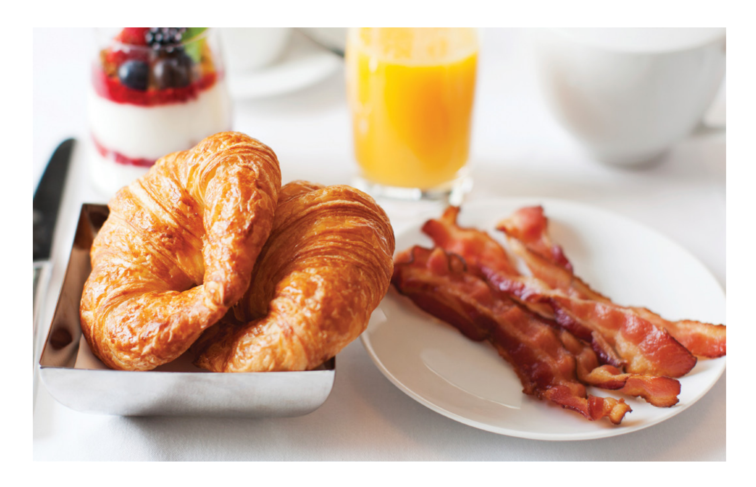
A 24% service charge and applicable State and Local Sales Tax is added to all food and beverage charges. Pricing based on a minimum of 50 guests.

Carving Station (Ham or Sirloin)*$15 per guest Bagel and Lox $12 per guest