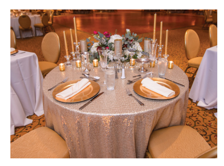
A 24% service charge and applicable State and Local Sales Tax is added to all food and beverage charges. Pricing based on a minimum of 50 guests.