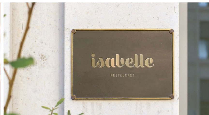
THE PEARLE AMENITIES