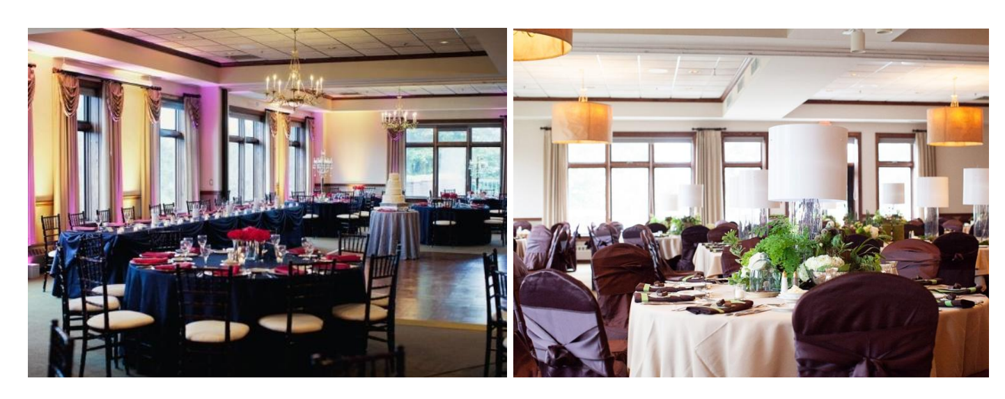
Butte des Morts Country Club has a room rental fee of $1,000 and a $3,500 Food and Beverage Minimum.