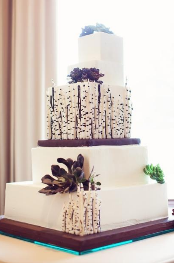
Wedding Cakes – Licensed vendors allowed only. A copy of the license may be requested from your bakery.

Cake Cutting — Butte des Morts will cut your cake complimentary if your cake is served immediately after dinner service. This requires your cake cutting pictures to take place before dinner. BDM will cut your cake during dinner (takes approximately 30 minutes), and will have it ready to be served once dinner entrees have been completely cleared.