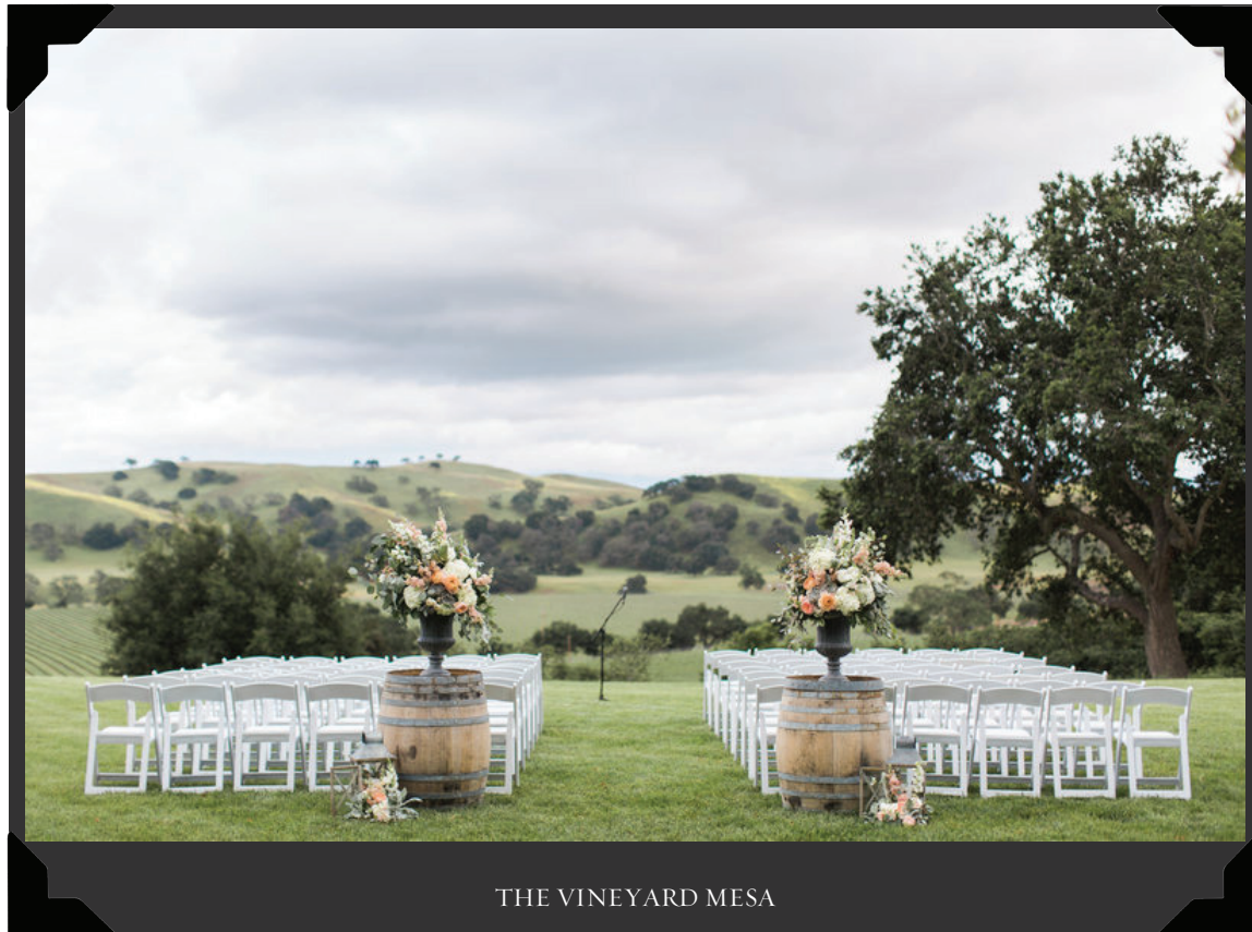
THE VINEYARD MESA