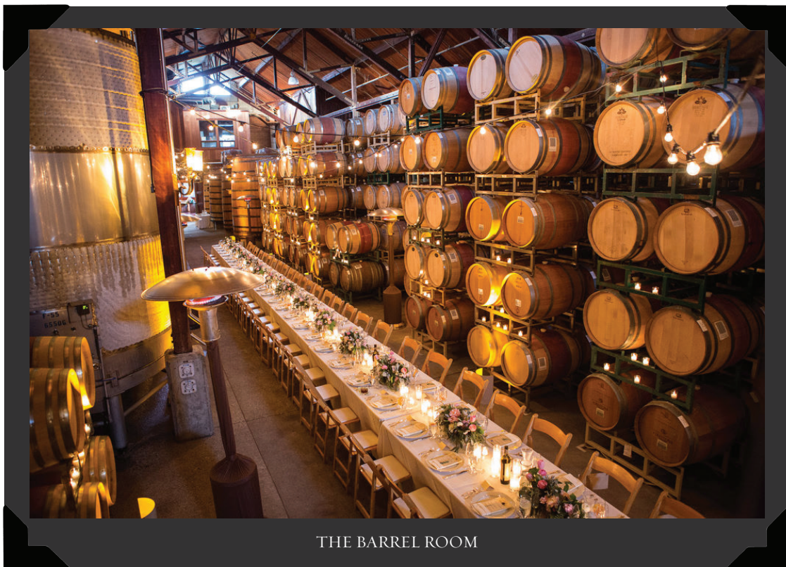
THE BARREL ROOM