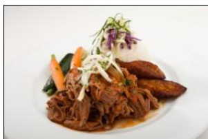
'Ropa Vieja' (Shred Beef)