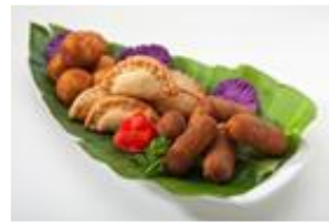
Hot Hor d' Oeuvres