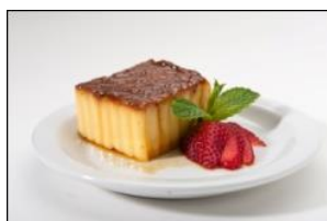
'Flan' (Caramel Custard)