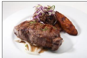
New York Steak