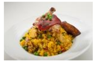
Saffron Chicken Rice