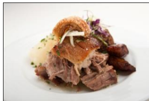
'Lechón' (Pulled Pork)