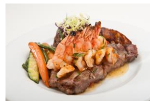
NY Steak & Scampi