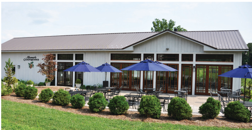
Albemarle CiderWorks Tasting Room & Patio

ALBEMARLE CIDERWORKS TASTING ROOM WWW.ALBEMARLECIDERWORKS.COM