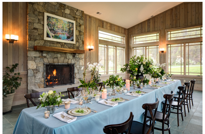
The Orchard Room