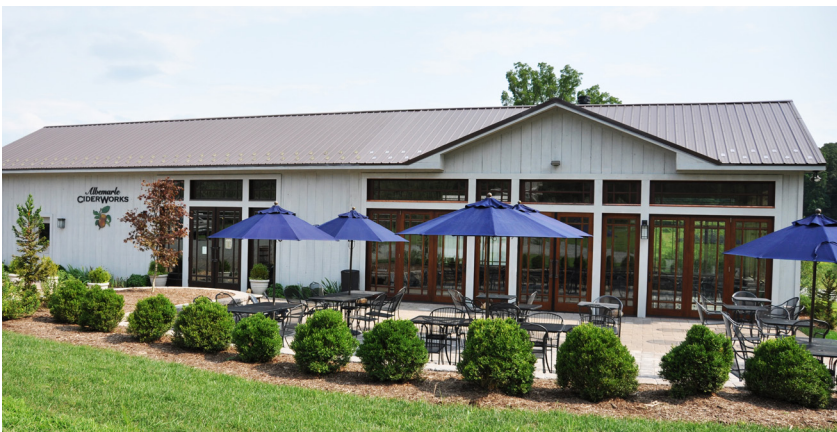
Albemarle CiderWorks Tasting Room & Patio