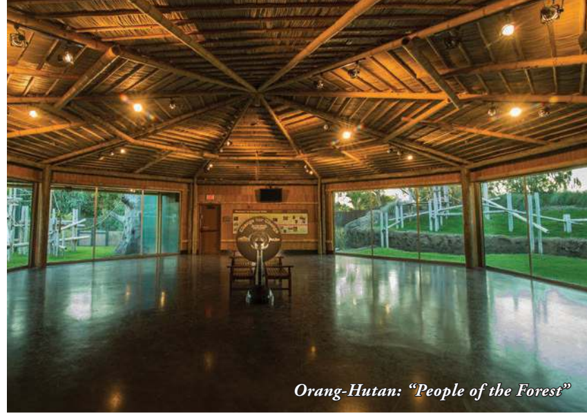
Orang-Hutan: "People of the Forest"