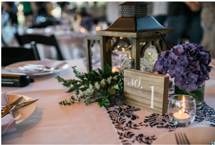
Tables come with white linens and wooden lantern with fairy lights. You add the additional décor or floral.

Sah-Hah-Lee Golf Course 17104 SE 130 th Ave, Clackamas Oregon 97015 503-655-9249