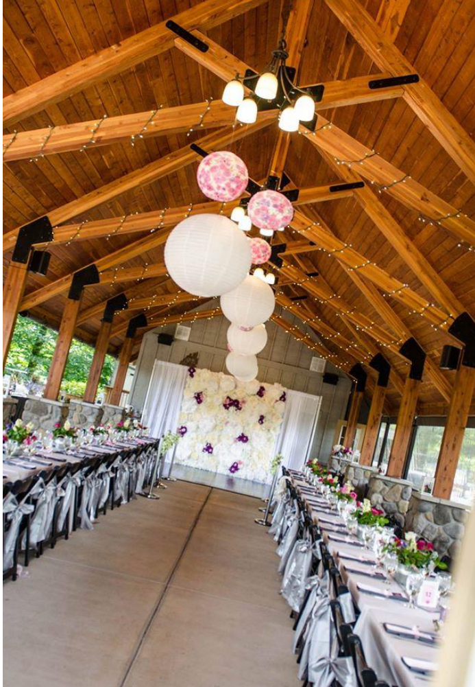
Venue is flexible with different types of seating arrangements/ Ceremony inside Pavilion