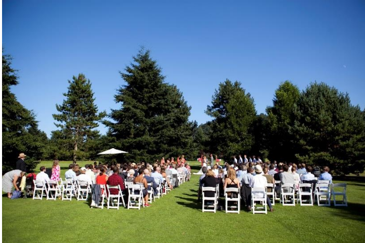
Ceremony on the Golf Course can be added to Classic Package