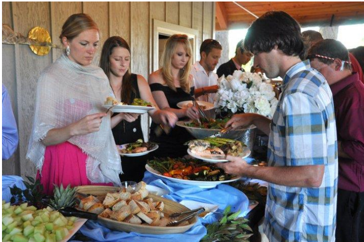
12 ft. Granite counter top for food served buffet style.