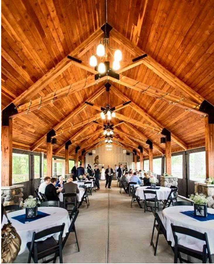
Winter Months- Pavilion is enclosed and heated and seats up to 100 guests.