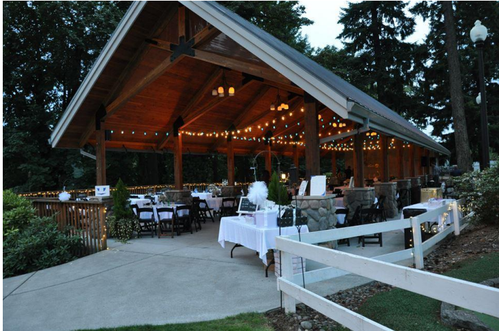
Pavilion in the Summer Months – June- Mid October