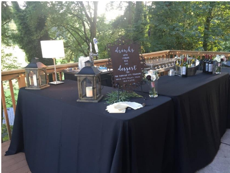
Bar set up with one bartender, serving beer, wine and champagne.

Sah-Hah-Lee Golf Course 17104 SE 130 th Ave, Clackamas Oregon 97015 503-655-9249