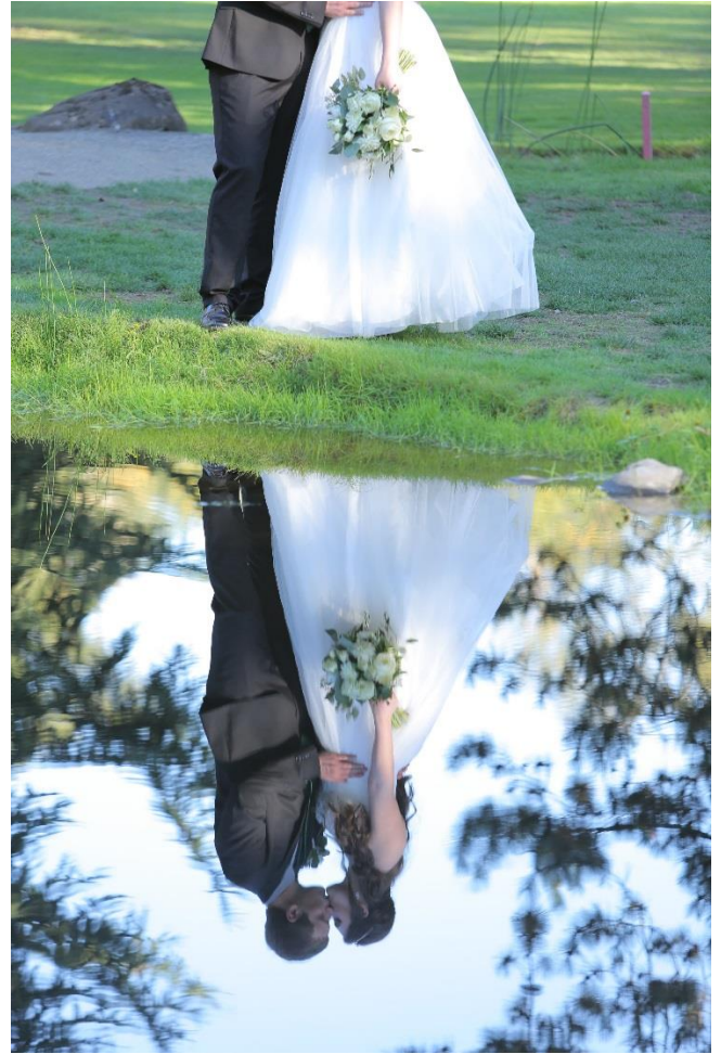
Beautiful Areas for Wedding Photography

Sah-Hah-Lee Golf Course 17104 SE 130 th Ave, Clackamas Oregon 97015 503-655-9249