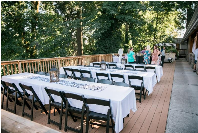
Deck for Ceremony or additional seating for guests.

Sah-Hah-Lee Golf Course 17104 SE 130 th Ave, Clackamas Oregon 97015 503-655-9249