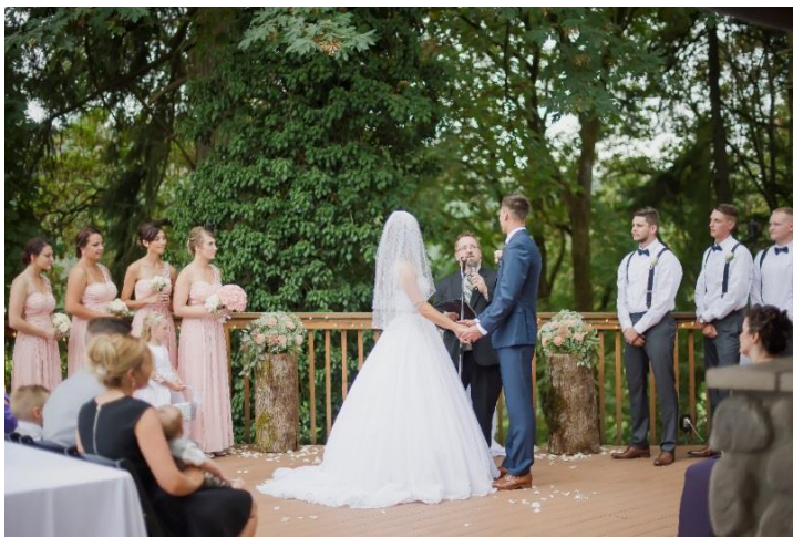
Classic Wedding Package- Deck of Pavilion Ceremony. Wireless microphone with speakers are provided for vows, toasts and music.

Sah-Hah-Lee Golf Course 17104 SE 130 th Ave, Clackamas Oregon 97015 503-655-9249