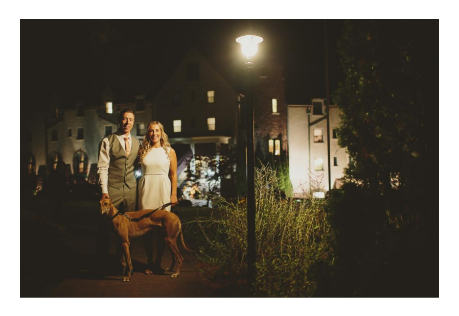
Let the Digby Pines work its magic ... turn your wedding day into the event You have always dreamed of ... And one that you, your family and friends will never forget