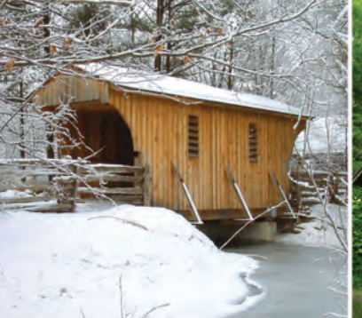
Covered "Kissing" Bridge