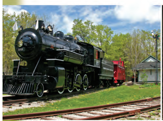
Train Station and Locomotive 103

From Cambridge - Follow Hwy. 8 to Kirkwall Road. Turn left onto Kirkwall Road and proceed 1.5 km.