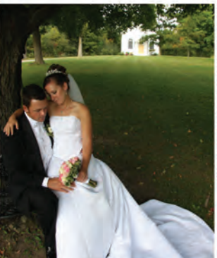
The "Village Green"