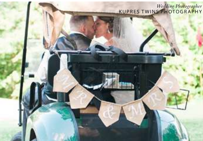
Wedding Photographer KUPRES TWINS PHOTOGRAPHY

Access to our Certified Wedding Coordinator to help your wedding planning run smoothly from the moment you book through the final dance on your wedding day • Wedding planner book & budgeting guide • Complimentary food tasting • White or champagne tablecloths, napkins, & elegant skirting • Choice of silver or gold Charger plates for your guest tables • Luxurious bridal suite with private bathroom & flat-screen television • Wedding Day Survival Kit for bride & bridal party • Private cocktail hour for wedding party with stationed hors d'oeuvres & drinks • Outdoor garden for cocktail hour for your guests • Butlered hot hors d'oeuvres for guests during cocktail hour • Signature drink served butler-style during cocktail hour • Golf carts & guided access to the golf course for pictures • A sparkling champagne toast for all of your guests • Complimentary bottle of champagne for your table • Customized floorplan & table layout • Direction cards for inclusion with your invitations • Escort card & favor table set-up • Cake presentation, cutting, & service • Silver or gold wedding cake stand • Two bottles of liquor for dollar dance • Coffee & tea station serviced throughout your reception • Coat closet & restroom guest amenities • Black glove service for dinner • Professional & valued vendor referrals • Wireless internet access for all of your wedding day needs