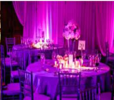
Elegant Up-Lighting & Accent Lights