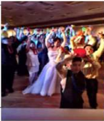
Dance Floor Packed

DJ Entertainers - Up-Lighting - Photo Booths