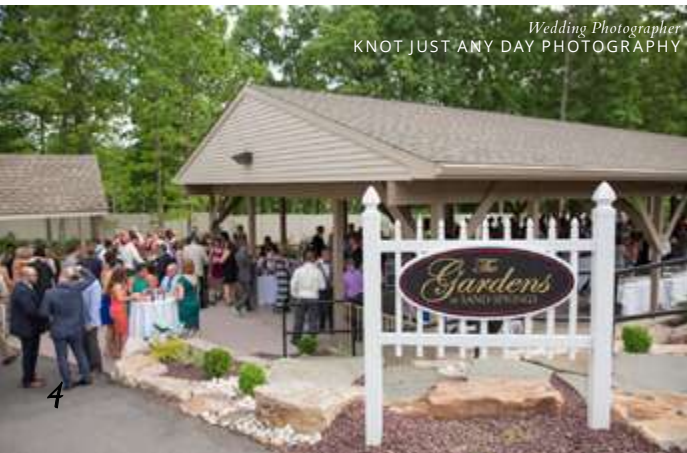
Wedding Photographer KNOT JUST ANY DAY PHOTOGRAPHY