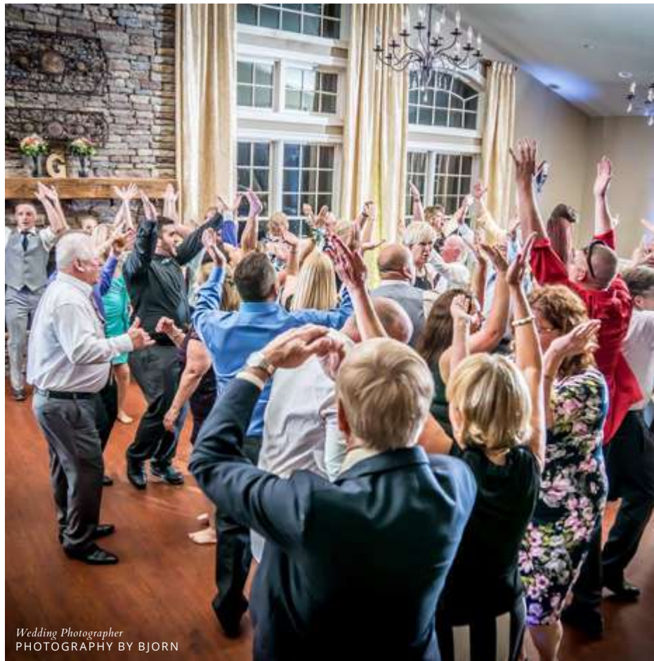
Wedding Photographer PHOTOGRAPHY BY BJORN