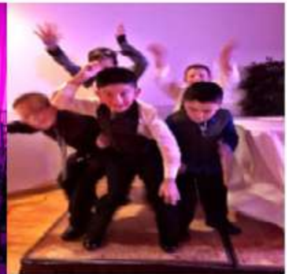
Fun for All

Harry C Productions, Inc. is a Sand Springs preferred Vendor