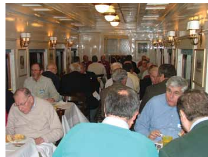
DINERS ABOARD THE GADSBY'S TAVERN