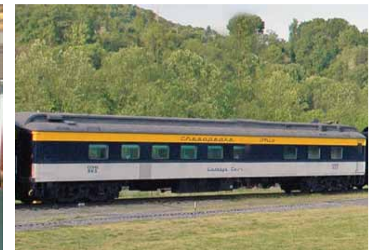
OUR 1922 C&O DINING CAR GADSBY'S TAVERN.