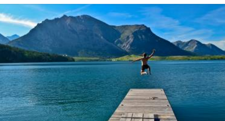
We are happy to assist you in planning your corporate activities, such as guided hikes, golf tournaments, boat cruises and more....