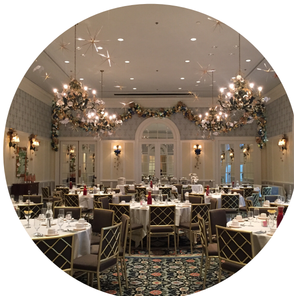
Robins Room GardenFest of Lights 2016