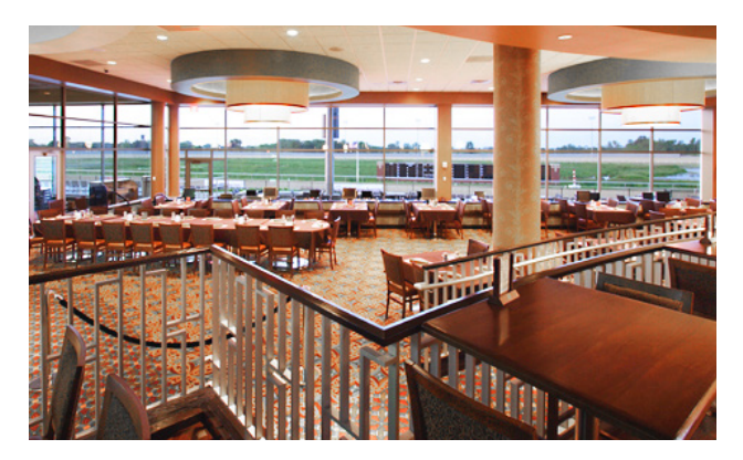
TROUT AIR TAVERN RENTAL: Indoor only - 60 guest maximum Indoor and outdoor - 100 guest maximum

The lower level of our contemporary, on-site restaurant, The Trout Air Tavern, can offer a semi-private event dining space. Our award winning cuisine offers locally sourced, fresh ingredients and unparalleled service. A large patio facing our racetrack is attached to the space that provides ample seating and additional dining spaces.