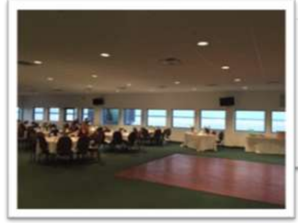
The Banquet Room