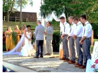
Outdoor Wedding Ceremony Area