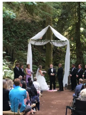
Cedar Haven Weddings - We love love