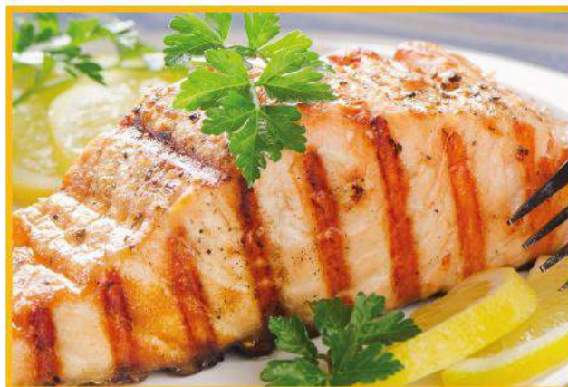
Salmon a la Parrilla

Penne Pasta with Shrimp, Chicken, Andouille Sausage, Diced Tomatoes, Scallions, in a Spicy Creole Sauce.