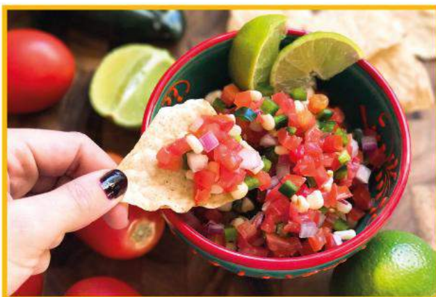
Pico de Gallo

Shrimp, Chicken, BBQ Ribs, Chorizo and Steak.