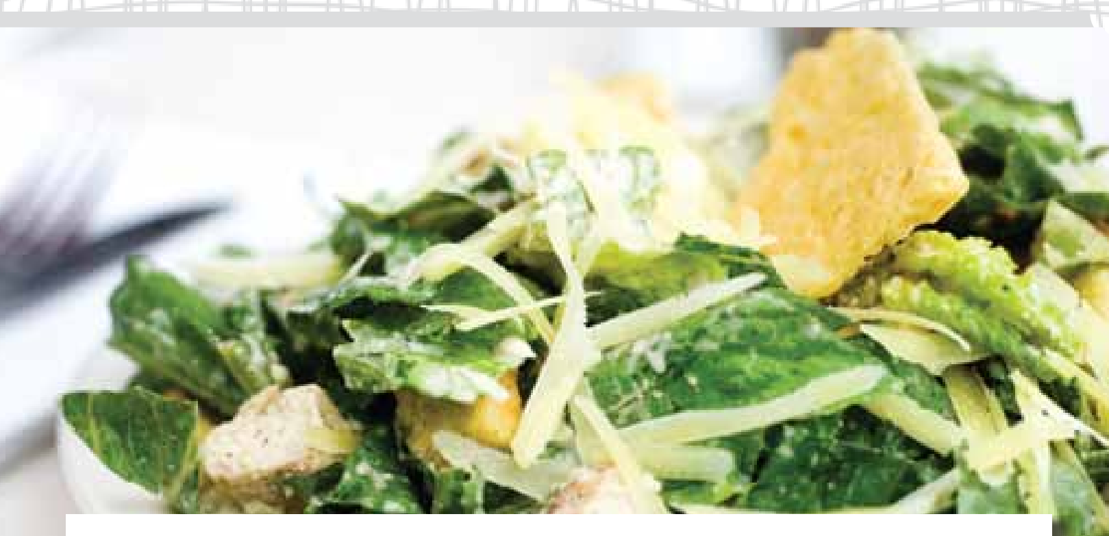
All entreé salads include freshly baked rolls from our bakery, whipped butter, coffee, iced tea and milk.