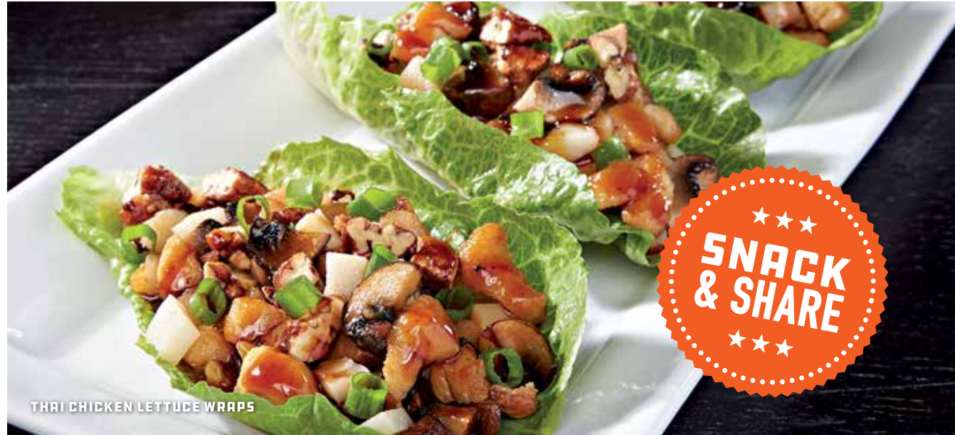
THAI CHICKEN LETTUCE WRAPS