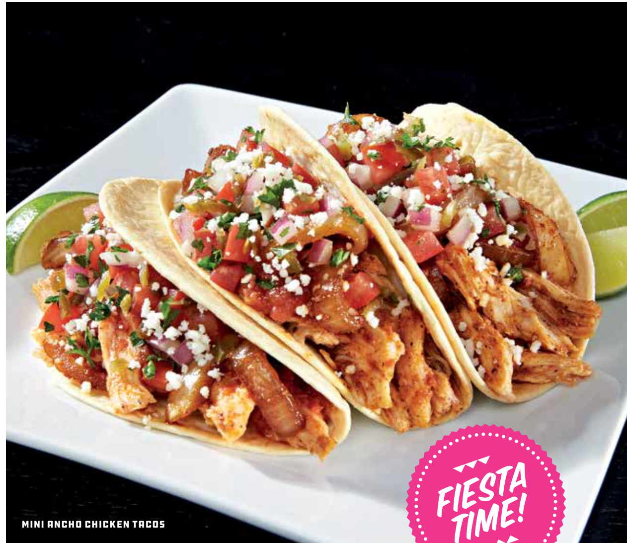
MINI ANCHO CHICKEN TACOS

*All prices are per person. Does not include area rental, tax or gratuity. Minimum of 15 guests required. Revenue minimums and other restrictions may apply.