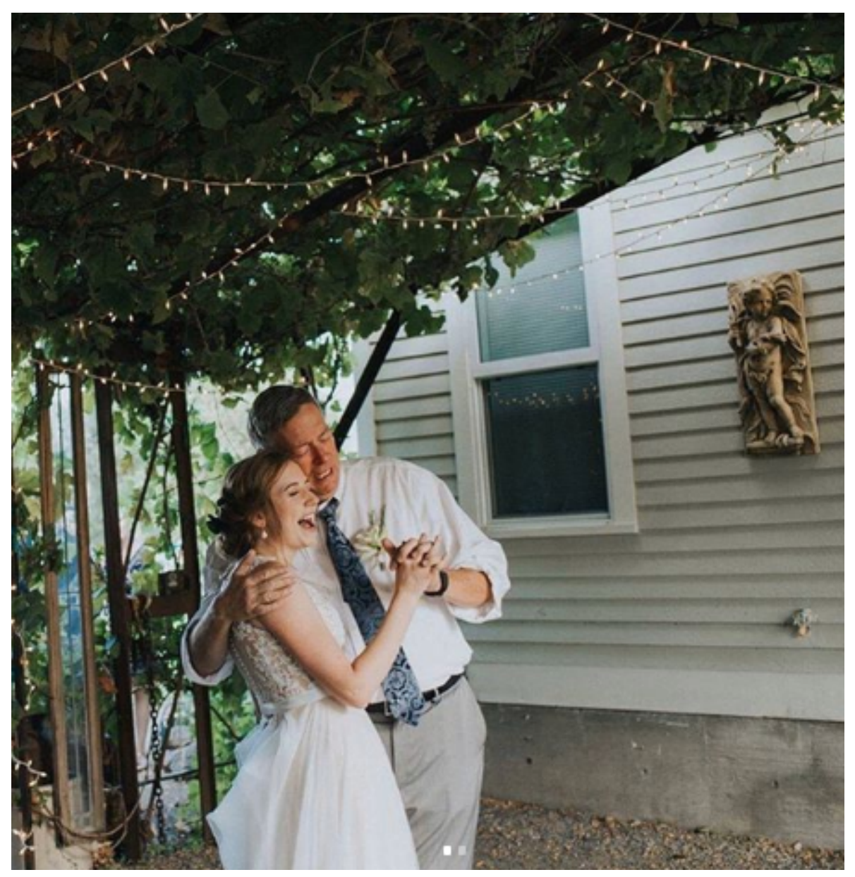
Site rental including outdoor reception package and portable restrooms only. No furniture or decorations are included.

*Overnight accommodations limited to 10 guests in bedrooms. Additional fee of $50 per night for guests staying in living areas.