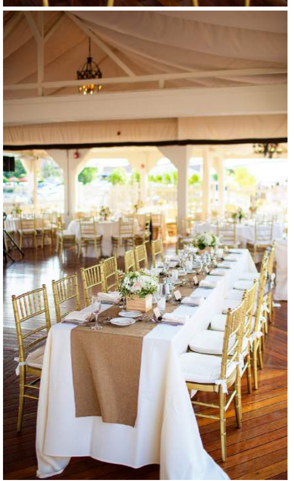
Jan 1 thru December 31 2020 rev. 06/01/19