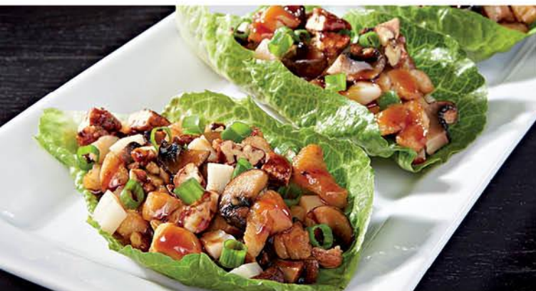
Thai Chicken Lettuce Wraps