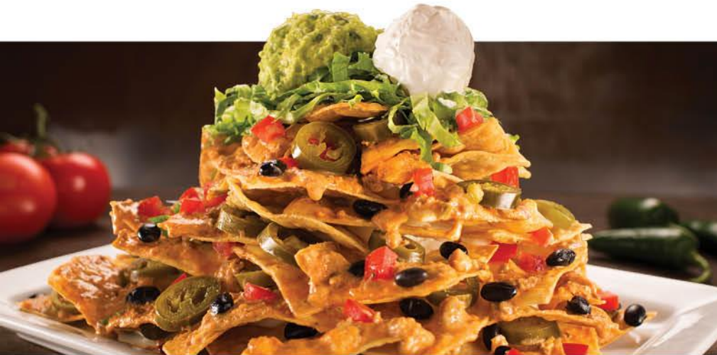
BYO Mountain O' Nachos

Garlic Mashed Potatoes • Potato Pancakes • Mini Baked Potatoes • Bacon Bits • Grated Parmesan • Crumbled Feta • Shredded Manchego Cheddar • Yogurt • Sour Cream • Queso • Alfredo Sauce • Green Onions • Fire-Roasted Salsa • Butter