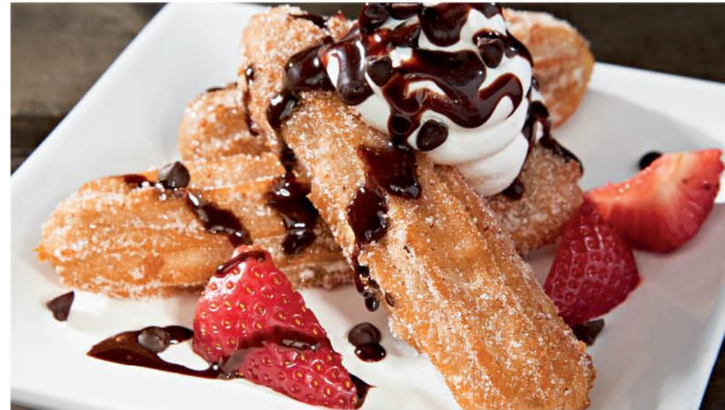
Churro Party Station