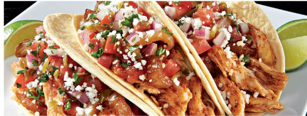
Mini Smoked Ancho Chicken Tacos

INCLUDE NEW! MINI SMOKED ANCHO CHICKEN TACOS FOR $7.29