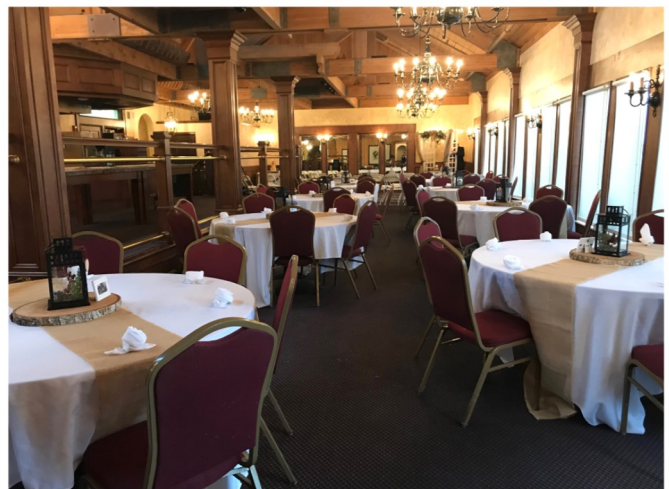
Heatherfields - 50 to 90 Guests