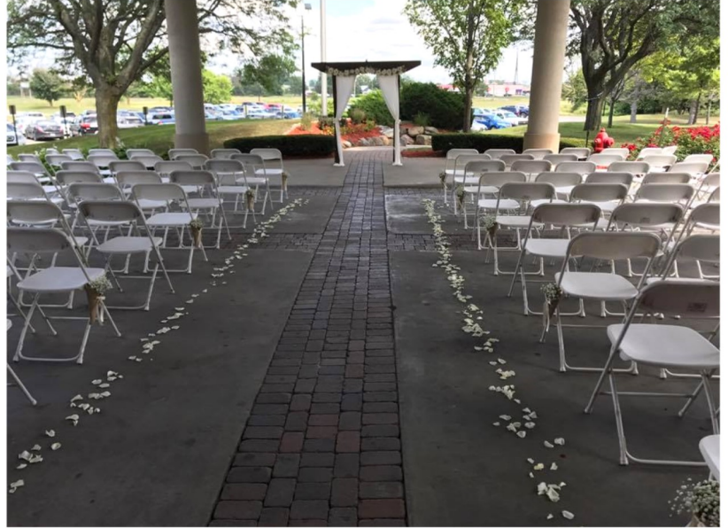
Carport - 50 to 125 Guests