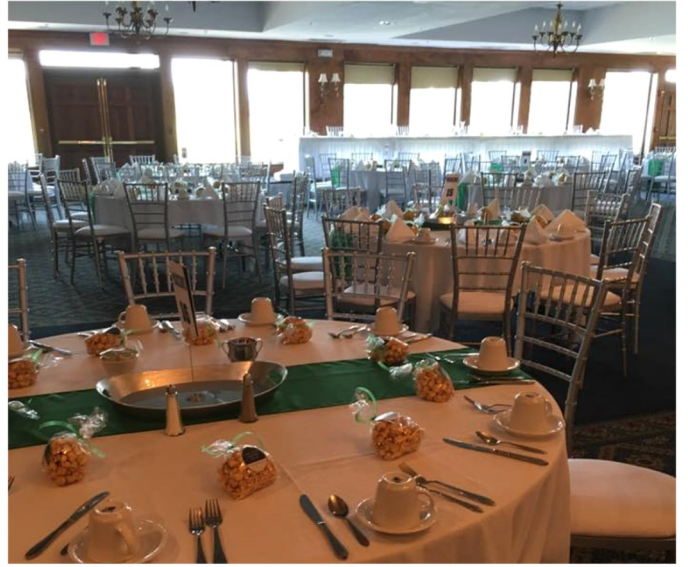
Royal Troon Ballroom - 125 to 350 guests