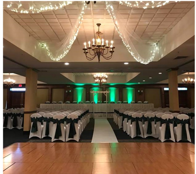
Royal Troon Ballroom - 50-150 Guests