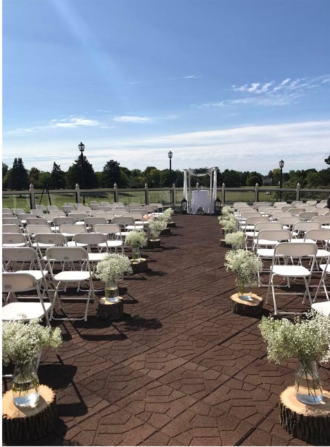
Terrace - 100 to 250 Guests