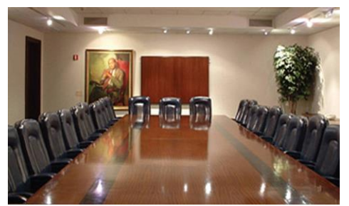
Trustees Board Room $1,000 / 4-hours 35 guests