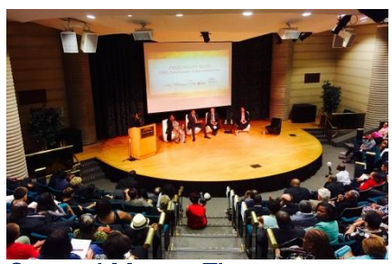
General Motors Theater $2,000 / 4-hours - Sun, Tues, Wed $2,400 / 4-hours - Thurs - Sat (Our A/V Services are required for all GM Theater rentals. One AV Tech is included with rental.)