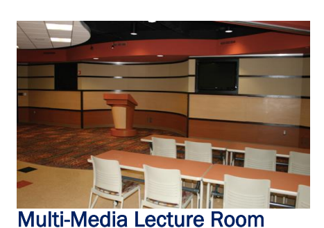
(Classrooms) One Classroom $400 / 4-hours Classroom style - 22 guests Auditorium style - 50-70 guests Workshop style - 60 guests