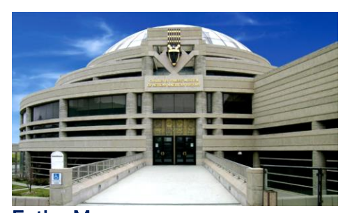
Entire Museum $15,000 / 4-hours 2,500 guests