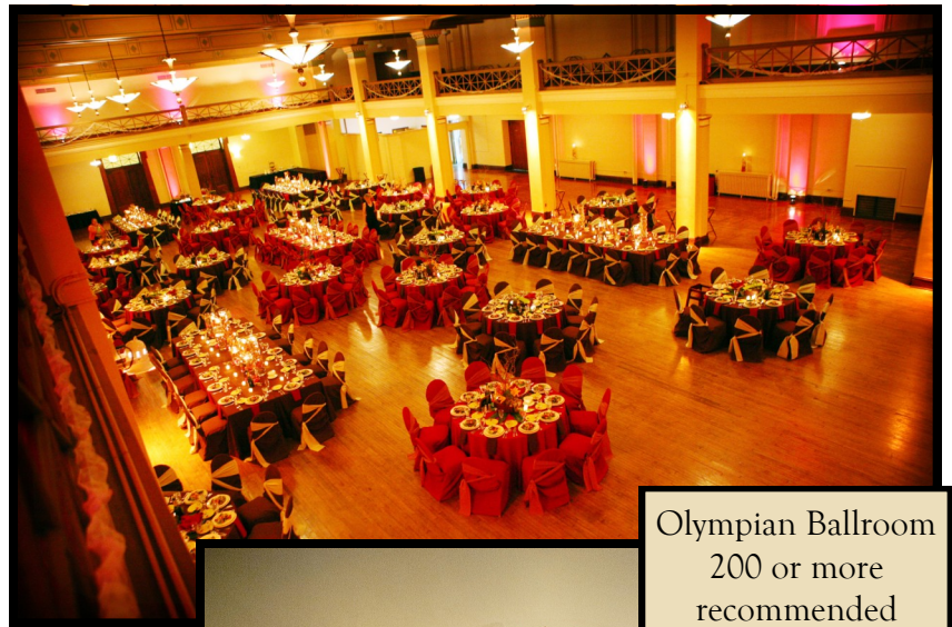
Olympian Ballroom 200 or more recommended

Beautiful event space options, quality catering, décor selections, and planning services make the Columbus Athenaeum a perfect Mitzvah venue.