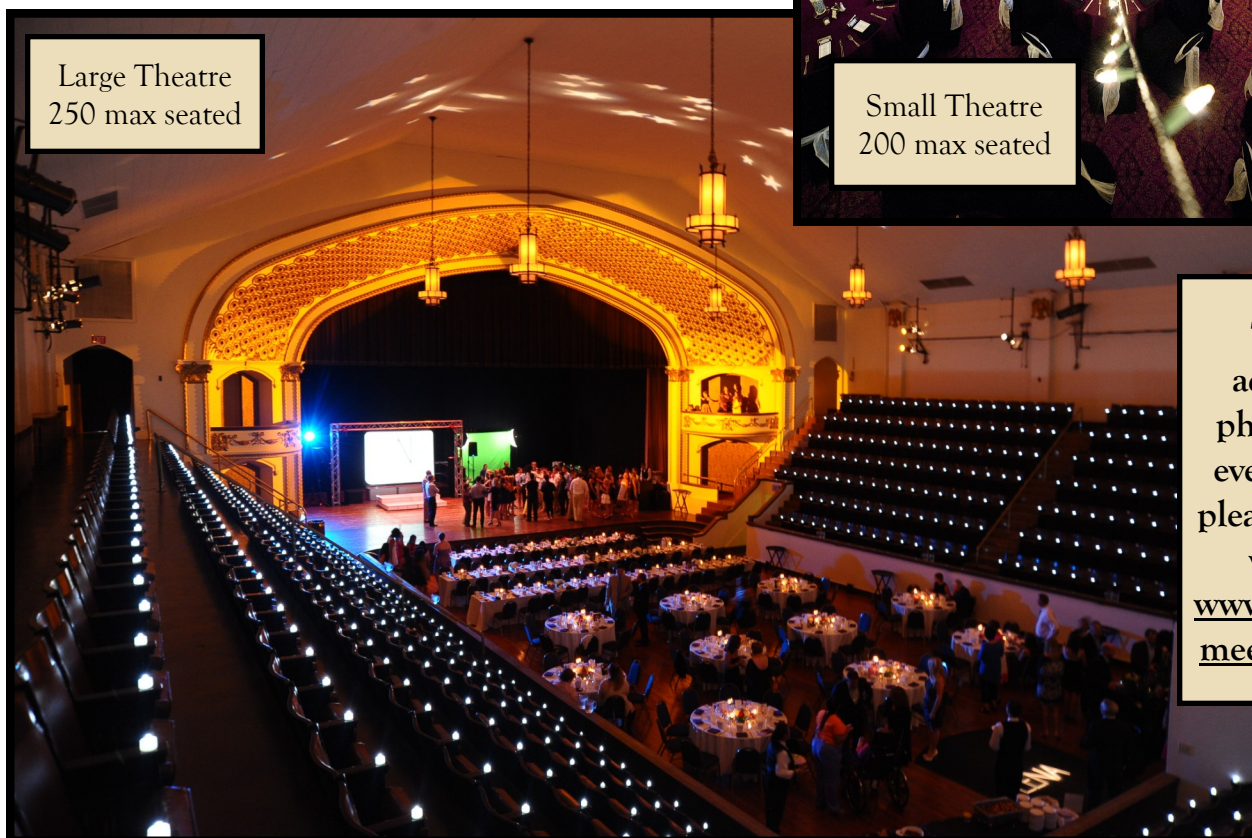
Large Theatre 250 max seated

To view additional photos of all event spaces, please visit our website: www.columbusmeetings.com .