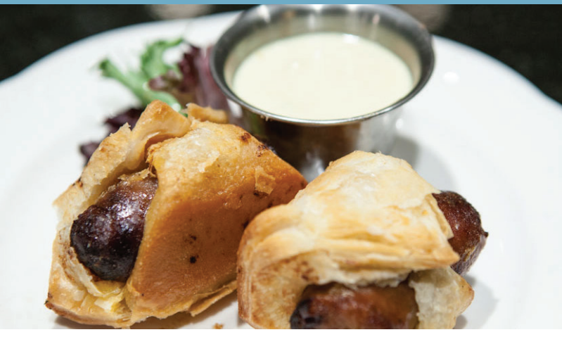
À la carte Snacks and Beverages: