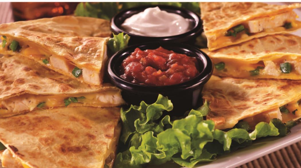
Grilled Chicken Quesadillas