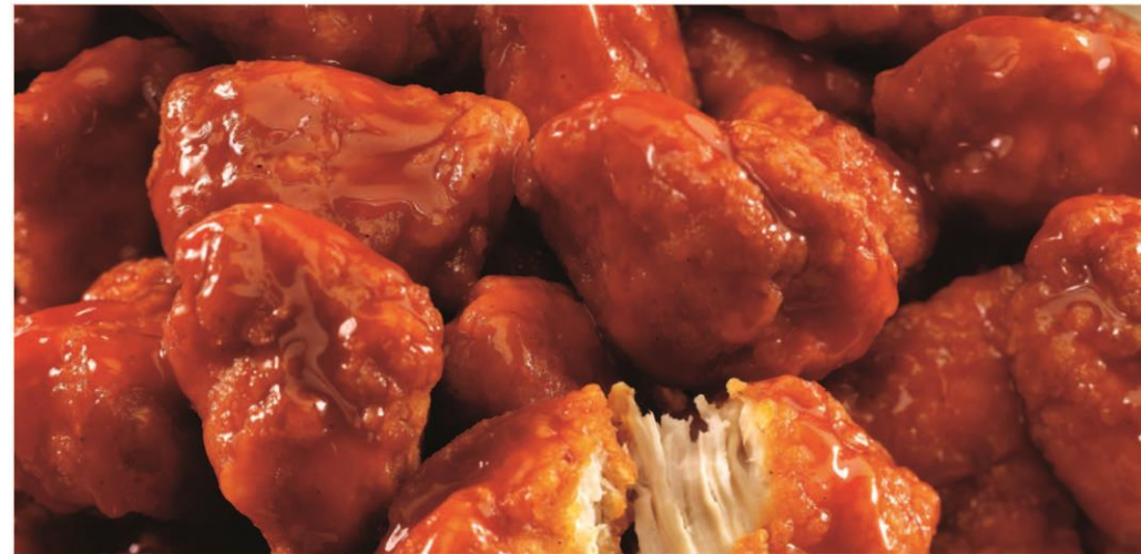
Boneless Buffalo Wings

10 Salty Pretzel Dogs with Habanero Dipping Sauce • 15 Classic Buffalo Wings with Ranch Dipping Sauce • 12 Grilled Chicken Quesadillas with Fire-Roasted Salsa