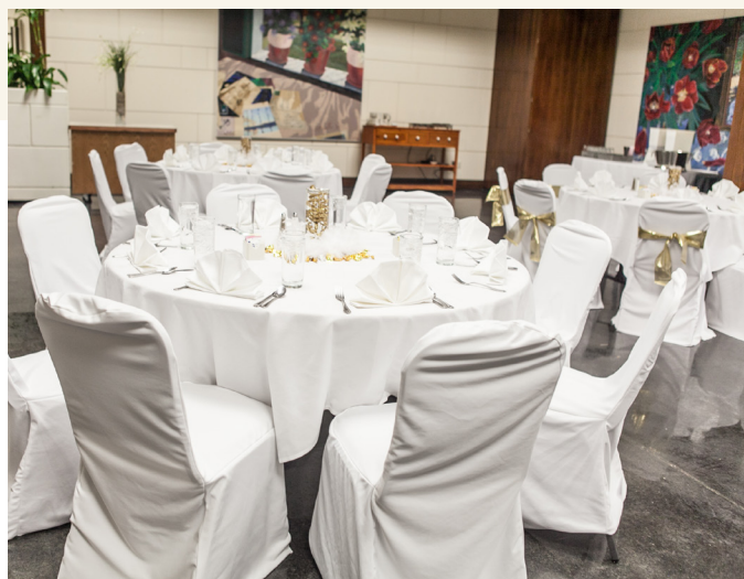
Table & Napkin Linens

If you need your tables decorated according to a very specific need, we have over 70 colors of linens to choose from in standard, lap, or floor length. Our table centerpiece options include fresh flower arrangements, and we also carry options for chair covers, sashes, runners, and overlays.