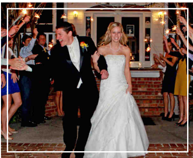
One of a Kind Events

Whether you are planning a small intimate ceremony or a lavish black tie event, the professional event team at Legend Oaks will help you create the complete wedding experience of your dreams. We are proud to have been named to The Knot's "Best of Weddings Hall of Fame" after receiving "Best of Weddings" awards for four consecutive years!