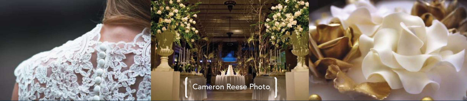
Cameron Reese Photo