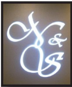
On the Wall

Prices include Gobo spotlight and Gobo production