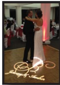
On the Floor