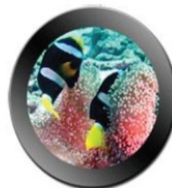
Full Color Glass