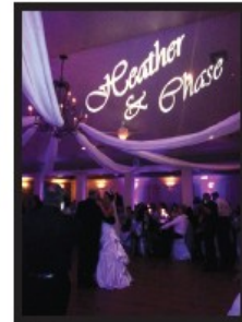
On the Ceiling