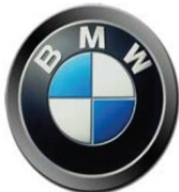
Two Color Glass