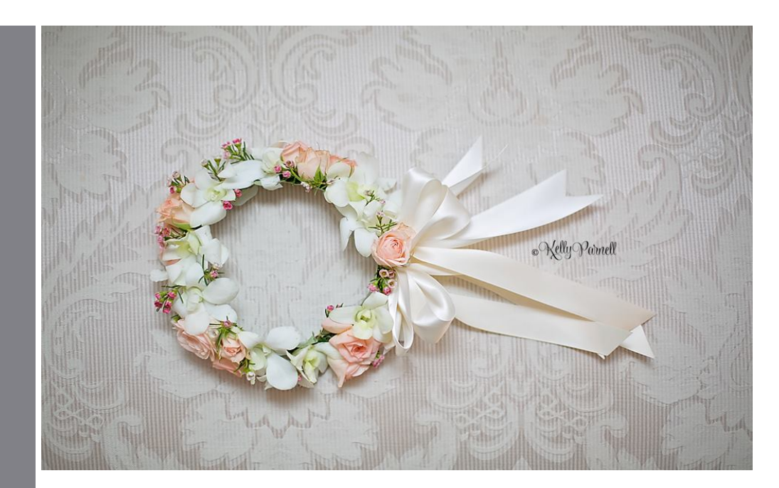
Simple Southern Elegance

Best of Weddings Award Winner 2013 - 2017