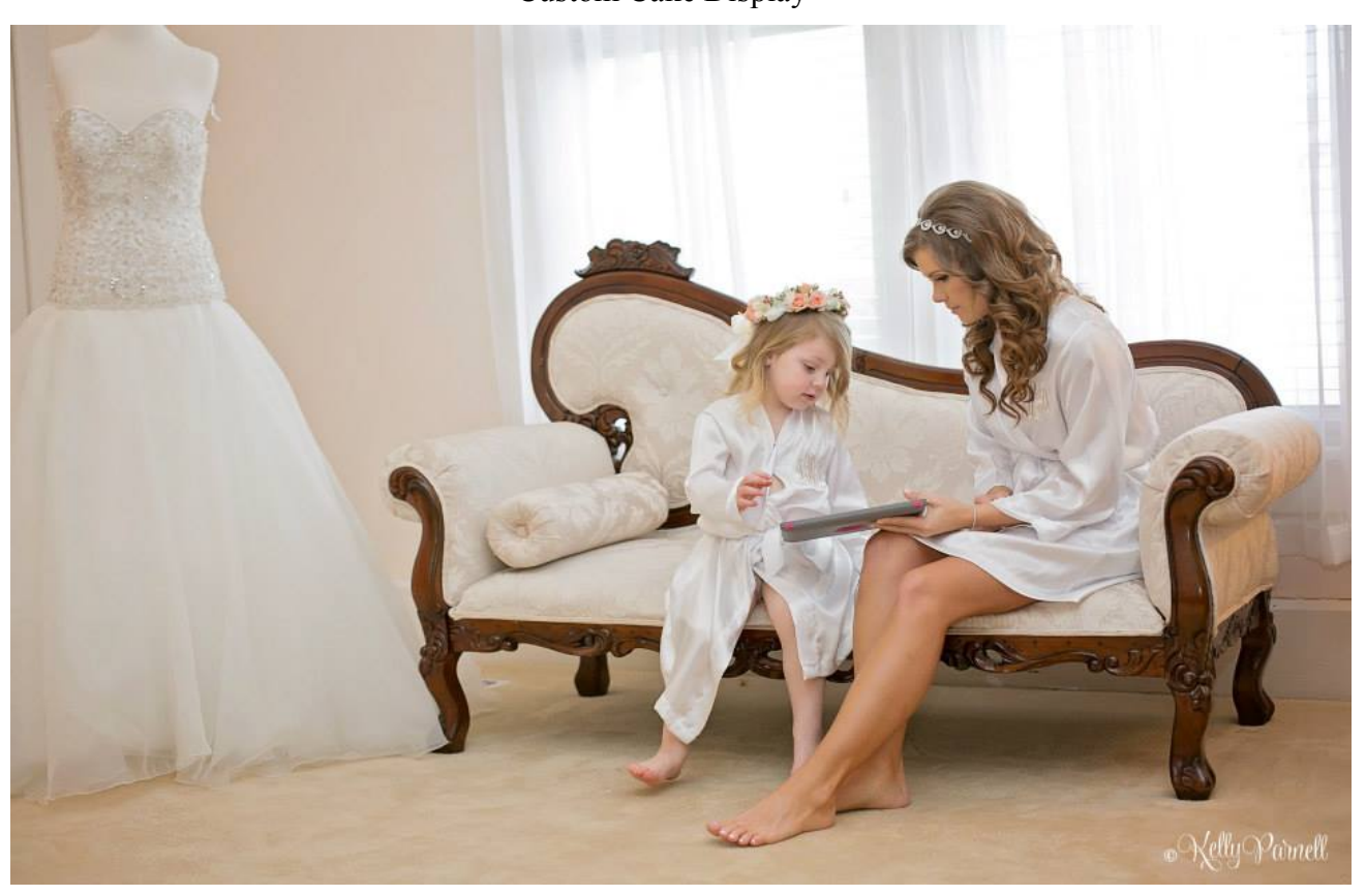
Ladies Dressing Suite