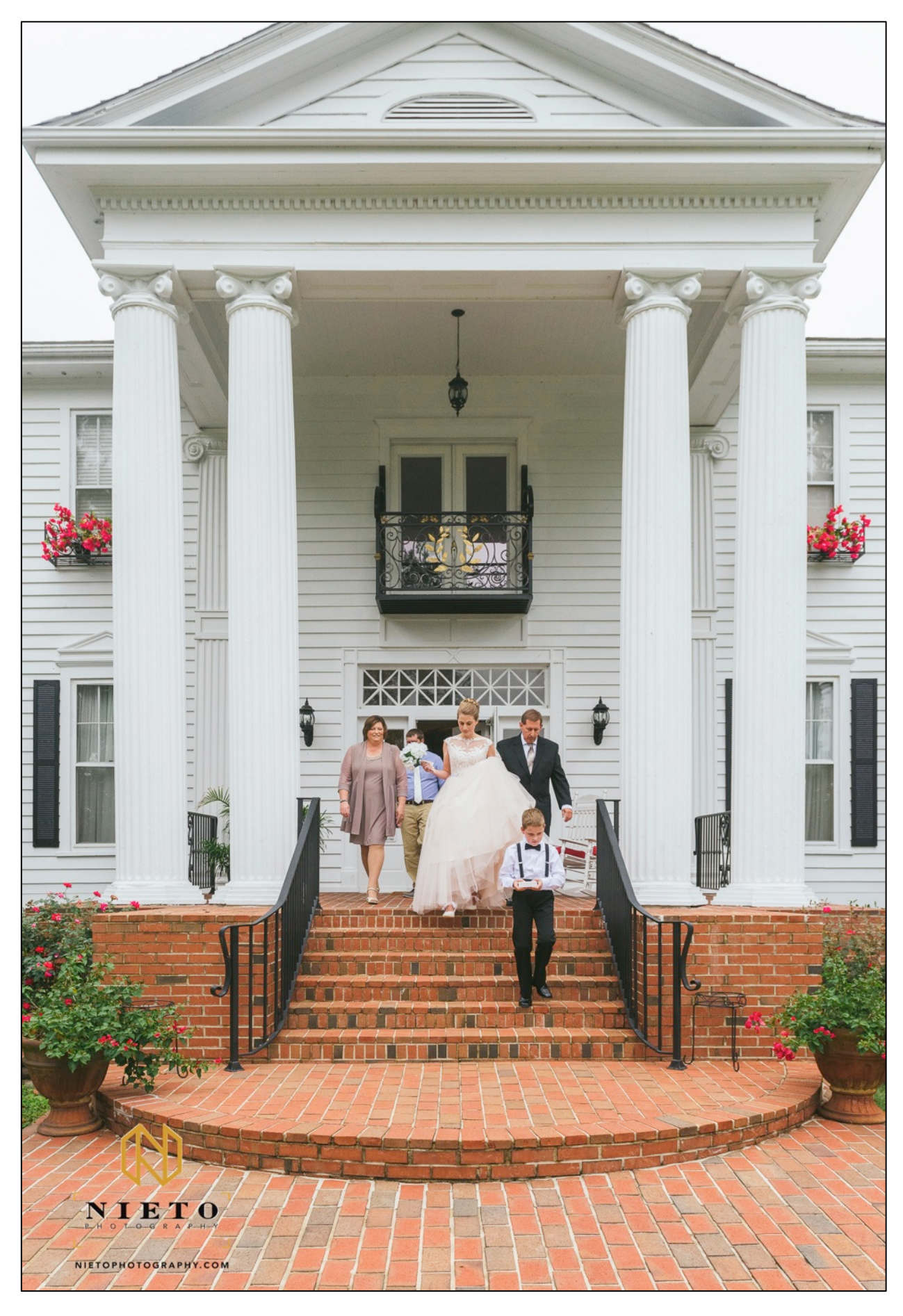
Manor House ca. 1916