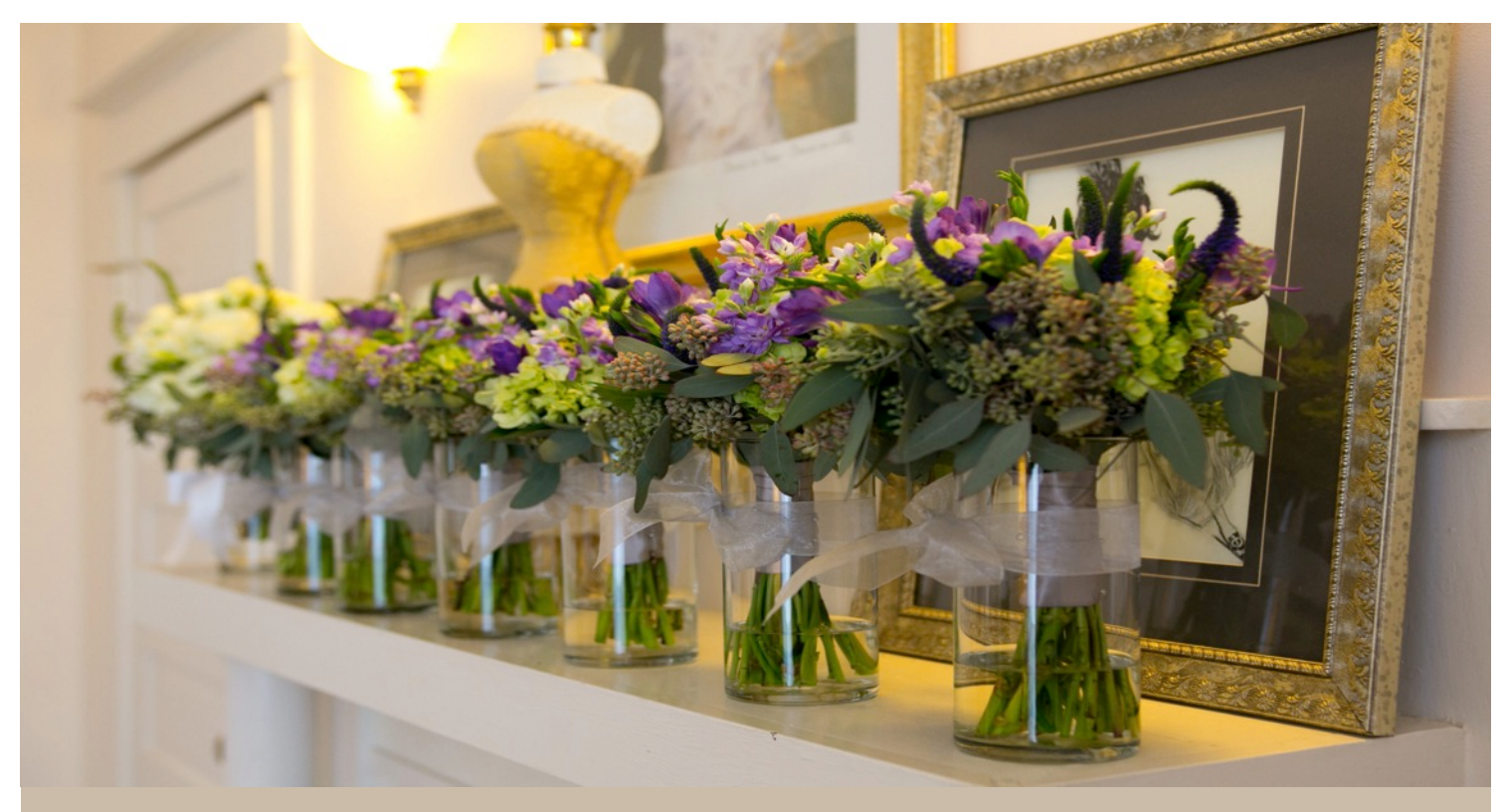
Why Hudson Manor?

In 2004, the Hudson Manor was the first NC wedding venue to offer an All Inclusive wedding package and we still offer the most inclusive package you will find, at a very competitive price. We host a limited number of weddings per year, usually only one per weekend, in order to provide our couples the care attention to detail that they deserve.