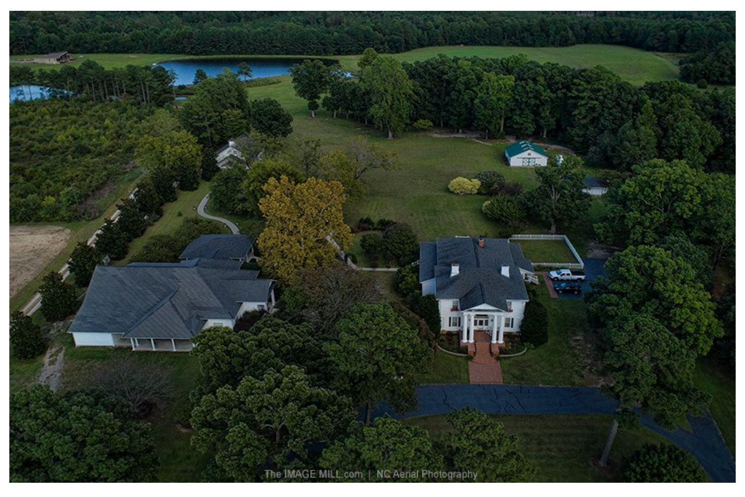
Manor House, Grand Ballroom with Covered Cocktail Lounge, Wedding Chapel and stables. Acres of pasture, gardens and crystal clear lakes.