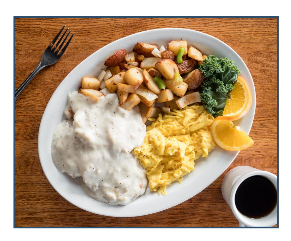
AMERICANA - $17.95 Per Guest

MUFFINS, DANISHES, AND CROISSANTS ASSORTED CEREALS SEASONAL FRUIT MILK, JUICE, AND COFFEE