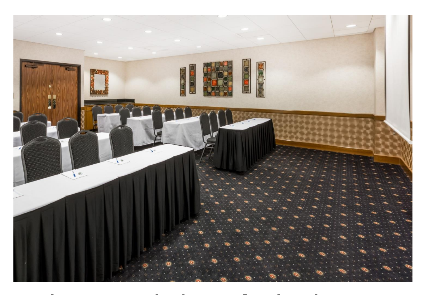
Arkansas Traveler is a perfect breakout room or small meeting space.