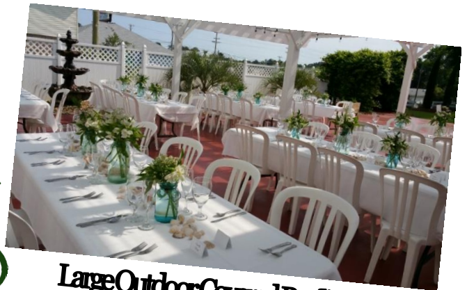
Large Outdoor Covered Pavilion