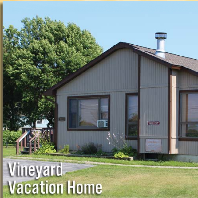
Vineyard Vacation Home