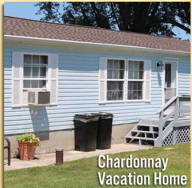
Chardonnay Vacation Home

Enjoy all of the amenities of the Alexandria Bay and Clayton areas including a community pool at Keewadin State Park, coffee shops, art galleries, unique stores, fitness center, boat tours, museums, kayak and boat rentals, golf courses, and a large playground. The Thousand Islands Snowmobile Trail is located on the property.