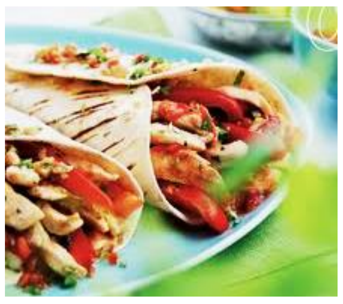
*ALL LUNCH BUFFETS COME WITH BERRY LEMONADE AND ICED TEA

A medley of vegetables with marinated chicken breast strips, fluffy white rice, veggie egg rolls, sweet and sour sauce, oriental ginger wonton salad, warm sesame rolls, chefs' choice dessert.