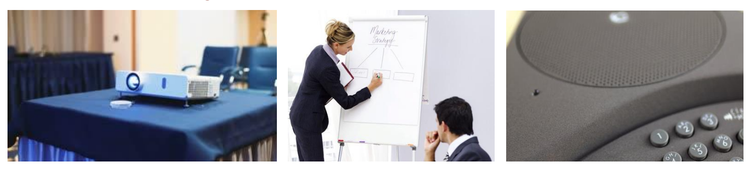
A twenty-two percent (22%) service charge and applicable state sales tax will be added to the above audio/visual items.

Meeting Room Rental includes complimentary wireless internet.