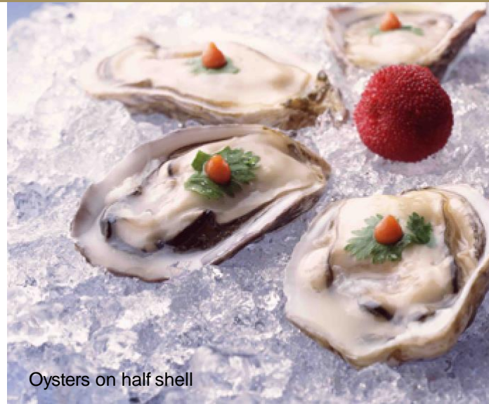
Oysters on half shell