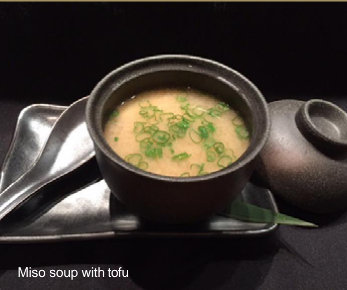
Miso soup with tofu

Each addition is $5 per person. Please inquire within for details.