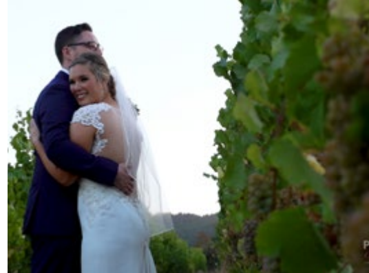
"I WISH I COULD LEAVE 1,000 FIVE-STAR REVIEWS FOR MATT." - RACHEL E.