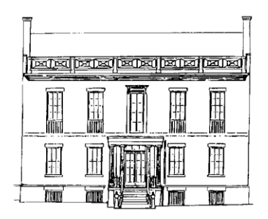
Ten Broeck Mansion • Erected 1798 • Albany, NY