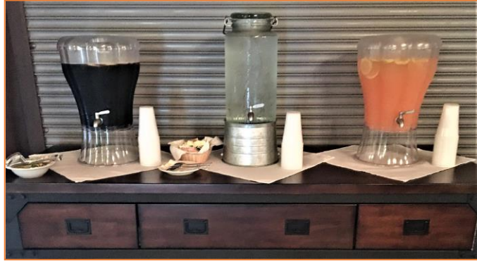
(Drink Station for Iced Tea, Water, and Lemonade)