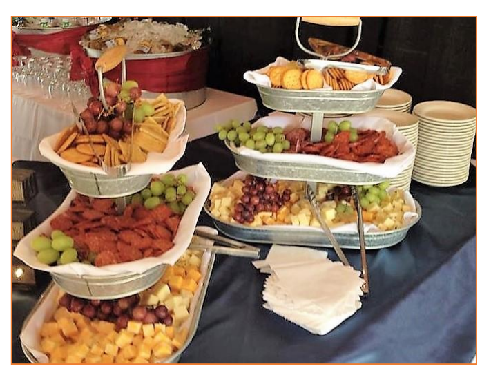
(Cheese and Cracker Assortment)