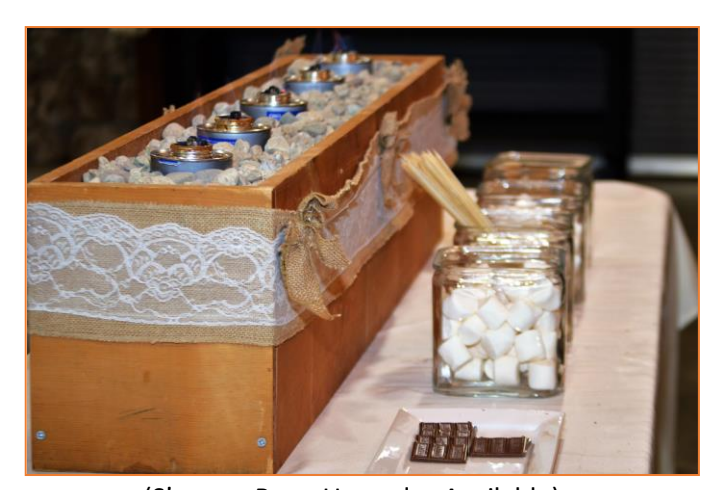
(S'mores Bar – Upgrades Available)