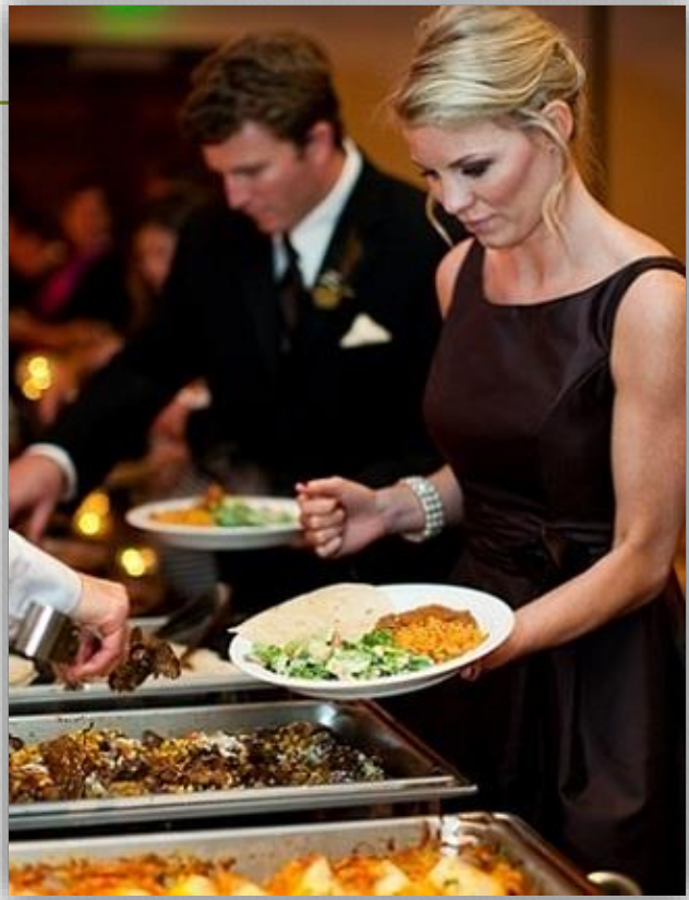
Outside caterers are welcome as well! We do currently allow you to use an outside caterer; however it must be a licensed, full-service caterer that has been approved by Homewood Suites. Please ask about our preferred caterers list.