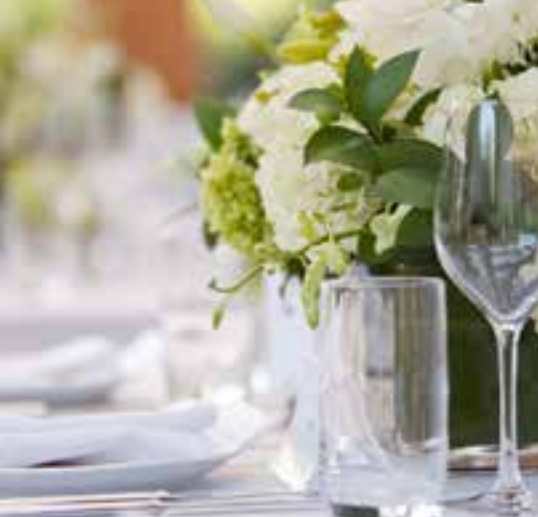
FIG & OLIVE