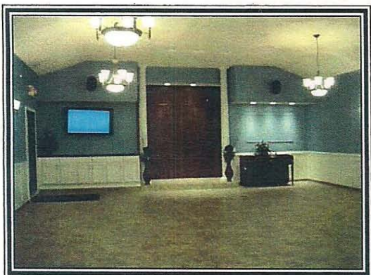
"The West Wing"