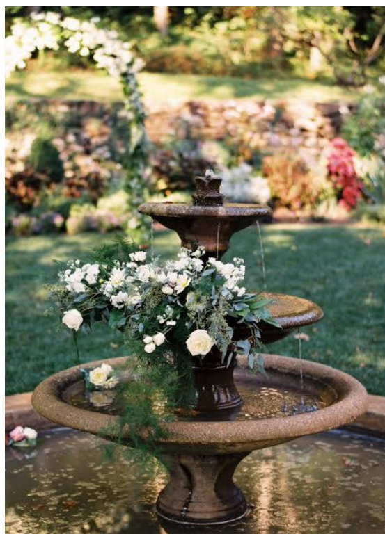
{ court yard }