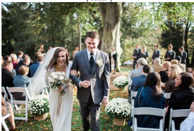
{ beech tree }