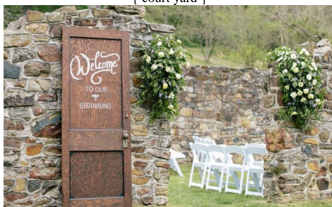
{ ruins }