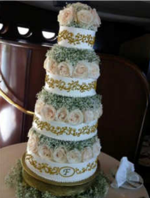
Maui Wedding Cakes