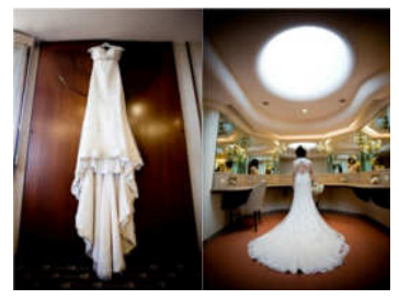
The Bridal Room

A wedding at The King Kamehameha Golf Club allows the bride to come in two hours prior to the ceremony start time. A room is given to the bride to put her dress on, touch up her make-up, and relax until it is time for her to walk down the aisle.