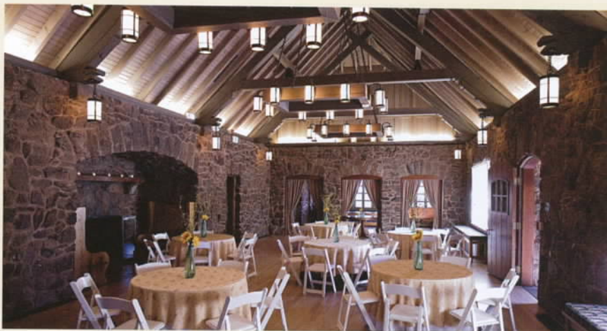
THIS MODERN LIFE PHOTOGRAPHERS

Originally the Mansion's "great hall", the 1,100-plus square-foot Fireside Room features a cathedral-beamed ceiling, moss-rock walls, wood floors and an "inglenook" (walk-in) fireplace. Flanked by the Buffet and Piano Rooms (each measuring 290 square feet), the Fireside Room also adjoins a 1,500 square-foot patio. Capacity is 200 guests maximum. See our fee schedule and capacity chart for more details.