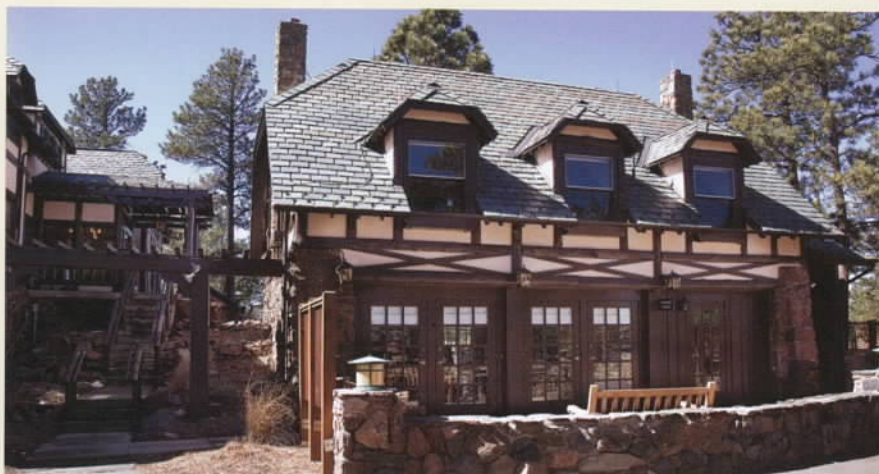
THIS MODERN LIFE PHOTOGRAPHERS